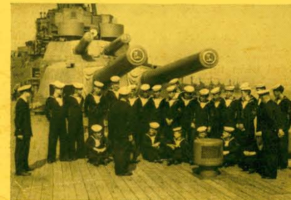
Canadian Sea Cadets overseas party aboard HMS Ramillies August, 1947.